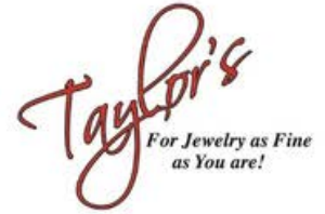
Taylor's Gold and Stone