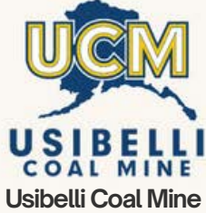
Usibelli Coal Mine